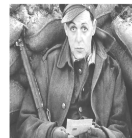
Sir Paul McCartney from his video "Pipes of Peace" from the album Pipes of Peace. (1983)

I ran across a headline that blamed Germany for World War 1 and thought that if it takes two to tango, four to play bridge and seven for an orgy then all the countries that had participated should share some responsibility for the devastation except, because of the war, became new and had to start with a mess they had inherited by the former leaders. Yet most people blamed Germany as the losers despite the demise of Ottoman Empire that came tumbling down but no one seems to care. The Soviet Union, due to its Socialist Revolution and leaving the war prematurely received the worst incrimination from both Allied and Axis powers. Immediately at the end of the War, both winners and losers of the war joined together to attack the newly formed Soviet Union. Even the last Premier of Russia, before the Bolshevik Revolution, Alexander Kerensky, and the Czars Secret Police; the Cossacks, joined and helped began the Russian Civil War which lasted until the Soviet Union sent the last American prisoner of war home in April of 1920. Oh well, war is so hard to please people unless you can take credit for the win even if you did not.