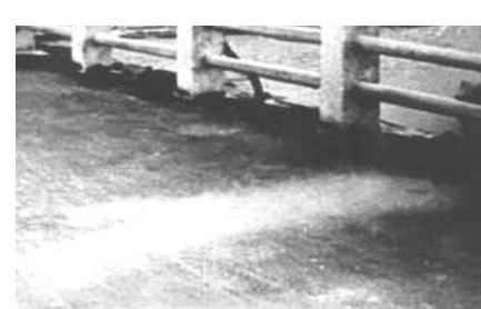
On August 6, 1945, during World War II (1939-45), an American B-29 bomber dropped the world's first deployed atomic bomb over the Japanese city of Hiroshima. The explosion wiped out 90 percent of the city and immediately killed 80,000 people; tens of thousands more would later die of radiation exposure. Pictured above are some of those who died and now their shadows remain.